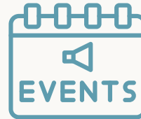
Annual company social events