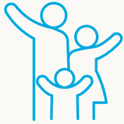
Family friendly policies