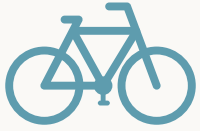
Cycle to Work Scheme