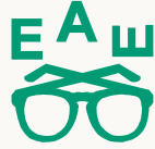
Free Eye Test