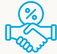
Commission Scheme (sales)