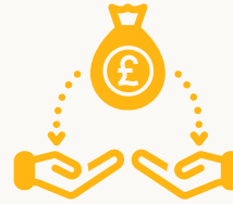
Company profit share scheme (for all staff not on a commission scheme)