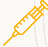
Free Seasonal Flu Jab