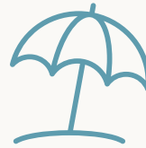
Additional holiday after 5 years' service