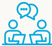
Coaching, Mentoring, training Career development