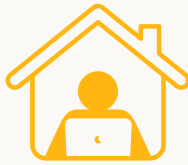
Hybrid working (role dependant)