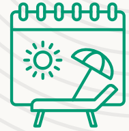
33 Days Annual Leave including bank holidays