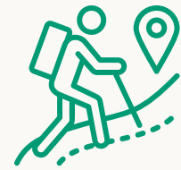
Company away days (hiking, canoeing etc)